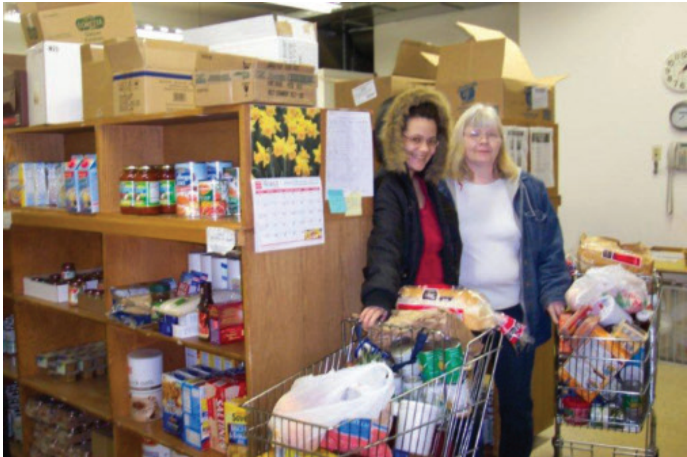
Photo Caption: North Central Community Action Agencies(NCCAA) Food Pantry

Poverty is the cause of unnecessary and preventable suffering among millions of Americans and thousands of Hoosiers of all ages.