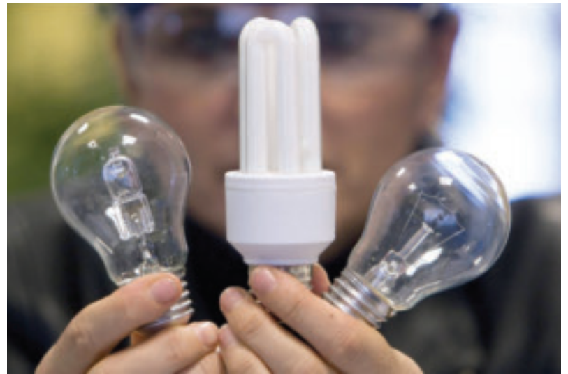
Photo Caption: In addition to providing financial assistance, Community Action Agencies also provide energy education and encourage families to modify lifestyles to reduce energy consumption in their homes. Reducing energy bills saves families money that can be used to meet other basic needs.

The Indiana Housing and Community Development Authority (IHCDA) is the state agency that passes Energy Assistance Program (EAP) federal funds through to the Indiana Community Action Network (Network). These funds provide financial assistance to low-income households for their energy bills during with the winter heating and summer cooling seasons. In 2010, families with annual incomes at or below 150% of the Federal Poverty Guidelines ($33,075 for a family of four in 2010) were eligible for benefits to help offset heating or cooling bills. In 2010, the EAP and Network provided energy assistance to 186,474 households. Utility companies also provide funding to the Network to provide financial assistance with energy bills to low-income consumers, however, guidelines for these assistance programs vary by utility company.