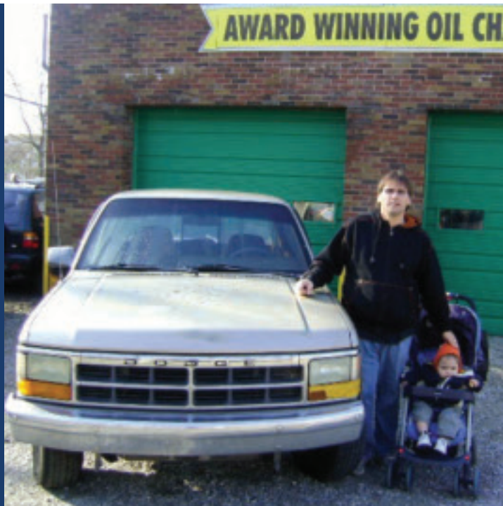
Photo Captions: The picture above is of a client who received assistance through the ARRA Auto Repair program administered by Community Action Program of Evansville and Vanderburgh County, Inc. (CAPE). The photo below is of the mobile food pantry administered by Area Five Agency on Aging & Community Services, Inc. (AREA FIVE).

The Indiana Community Action Network is fulfilling the promise of the federal recovery act by creating paths to economic security across the state. Through ARRA, Community Action Agencies have been able to expand their programs and services to address more of their local community's needs. Indiana's locally run Community Action Agencies have been able to serve more than 450,000 individuals and to date have created more than 1,600 new jobs in Indiana.