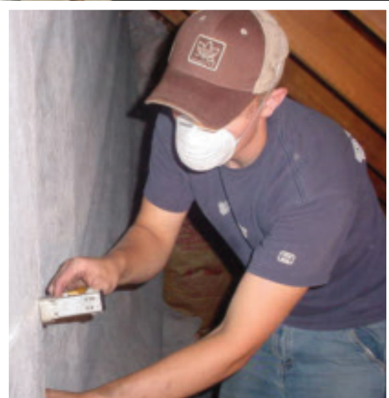
Photo Caption: Community Action of Greater Indianapolis (CAGI) contractor stapling vapor barrier

IHCDA channels Weatherization Assistance Program (WAP) federal funds through the Network to support energy conservation work activities for low-income Hoosier households at or below 150% of the Federal Poverty Guidelines ($33,075 for a family of four in 2010). A thorough evaluation of the structure, including the safe and efficient operation of the furnace and water heater, is included in the treatment of each home. The program provides energy efficiency services that are tailored to each house and are designed for maximum cost savings, which can include air sealing, insulation, domestic hot water and heating system work. As a result the program identifies and corrects many health and life threatening situations with heating and hot water systems. The Weatherization Assistance Program